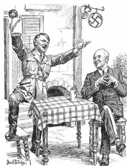
PROSIT! HERR HITLER: "THE MORE WE ARM TOGETHER THE PEACEFULLER WE'LL BE!" SIR JOHN SIMON: "WELL—ER—UP TO A CERTAIN POINT—AND IN CERTAIN CASES— PROVISIONALLY—PERHAPS."

Source J Bernard Partridge, a cartoonist, depicts Adolf Hitler and John Simon in the cartoon "Prosit!" [Cheers!] in the British satirical magazine Punch (27 March 1935). The wording on the tankard is "Conscription" and in the caption it is: Herr Hitler: "The more we arm together the peacefuller [more peaceful] we'll be!" Sir John Simon: "Well—er—up to a certain point—and in certain cases— provisionally—perhaps."